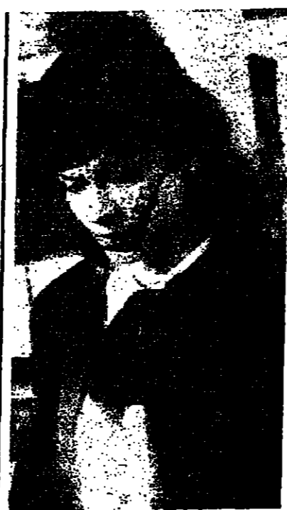
Nicaraguan-born Bianca Jagger, 33, on Friday was granted a divorce from husband Mick Jagger, lead singer of the Rolling Stones, on the grounds of his adultery with 25-year-old model Gerry Hall. The hearing in a London court was undefended.

humiliations of French authorities tended to overshadow his two decades of self-confessed murder, bank robbery, kidnapping and escape artistry.